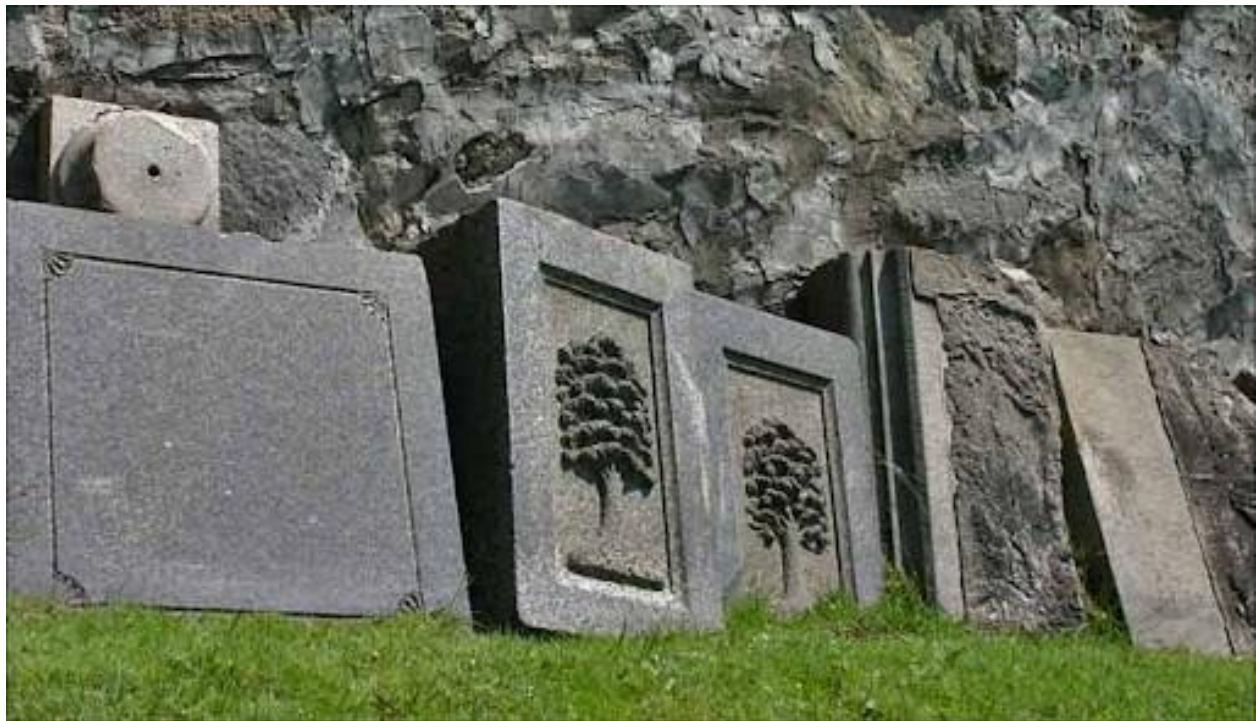
Remnants of 1925 tomb. http://209.95.34.155/~kalmakov/historical/farron peter verigin last fateful journey.html