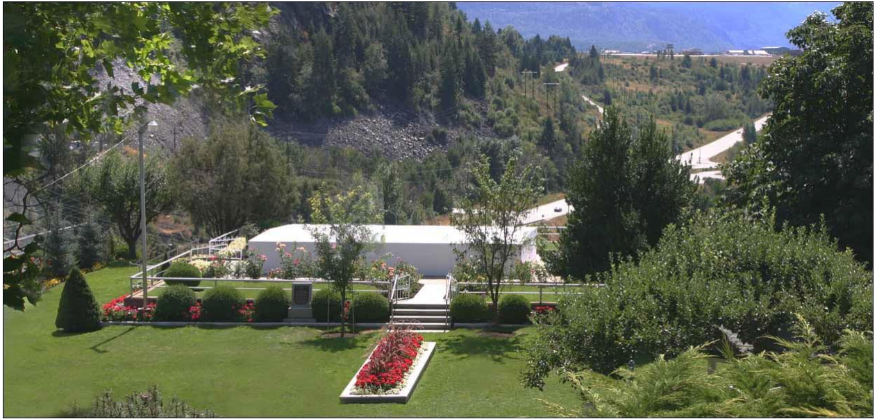
Verigin Memorial Park