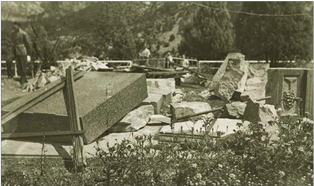
Verigin Tomb completely destroyed by deliberate bomb - Vancouver Province photo, 1944 - http://kalmakov.com/historical/farron peter verigin last fateful journey.html